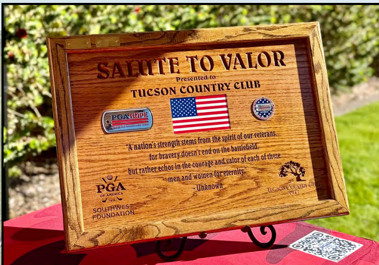
Tucson Country Club and The Patriot Legacy Fund continues to drive the Gold Standard for Facility support in Arizona. The annual 'Salute to Valor' event stands as the single largest contributor to the Foundation.